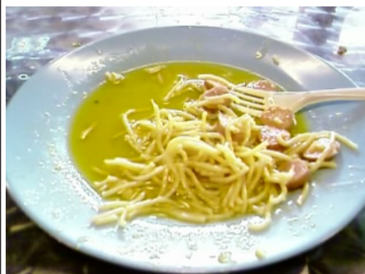
Above - Sodexo's "gourmet" food